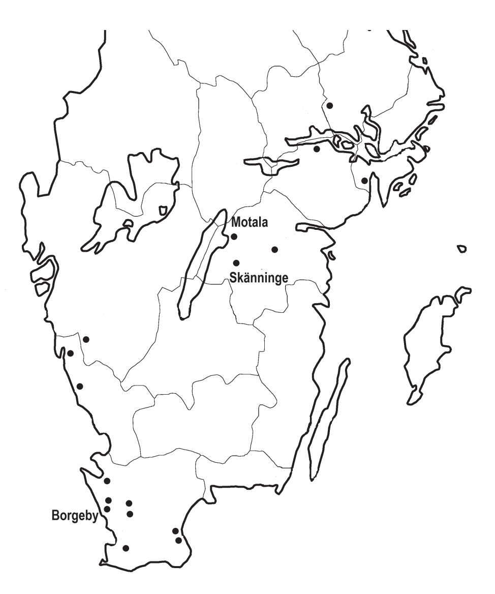
Fig. 1. Overview of southern Sweden showing identified multimetal sites. Each point represents one or up to five sites. Place names of sites discussed in the text indicated. Edited from Lantmäteriets översiktskarta.