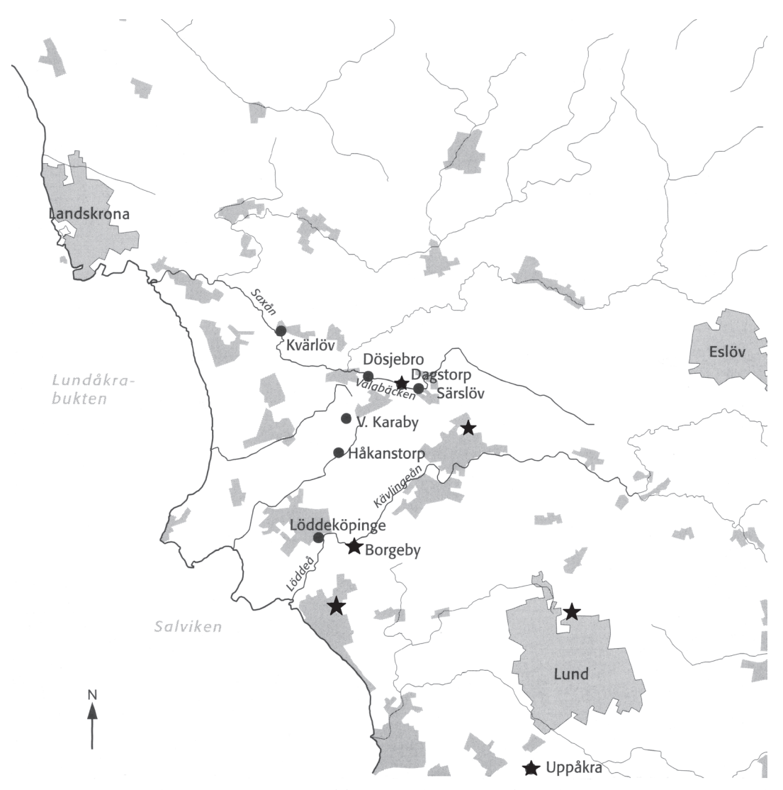
Fig. 3. Iron Age settlements with remains of forging and casting crafts in the Borgeby area. Multimetal sites indicated by stars (after Becker 2005, 281).

and complex metalworking is seen around Borgeby, western Scania. The presence of metalworking including handling of precious metals has been used as an indication of Borgeby's special economic status in the area during Late Iron Age and Early Middle Ages (Helgesson 2002, 74). The metalworking at Borgeby is clearly of a complex nature and of long continuity, as is shown by excavations