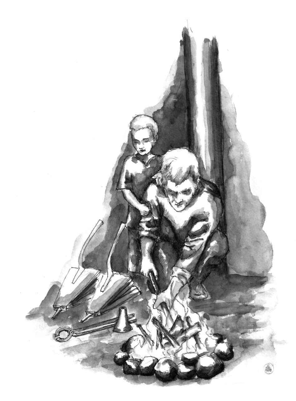
Fig. 4. Multimetalists at work. Drawing by Krister Kâm Tayanin/Gaia Arkeologi.

hearths dug directly into the ground with the aid of only rudimentary or temporary shelters (Svensson forthcoming).